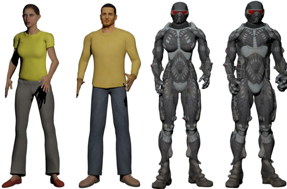
Figure 2. The avatars used in the game. Avatars were 'rigged' with skeletons which facilitated their animation during the game. These skeletons were identical between conditions: that is, gender-matched human and alien avatars contained the same skeleton to control for any advantage of bone length.

Player's rotational head movements were tracked by motion sensors on the Rift HMD.